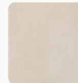
EARTH SAND 7527C