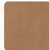
EARTH CARAMEL 7588C