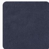
EARTH NAVY 2379C