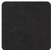
EARTH BLACK Black 6C

Textile fabric colours are subject to dye lot variation and will not be exact match to print Pantone reference.