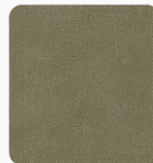
EARTH MILITARY 7770C