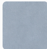
EARTH STONE BLUE 517C