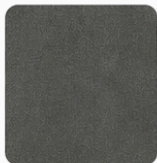
EARTH PEWTER Black 7C